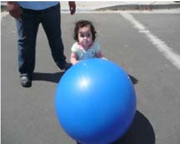
Having a ball