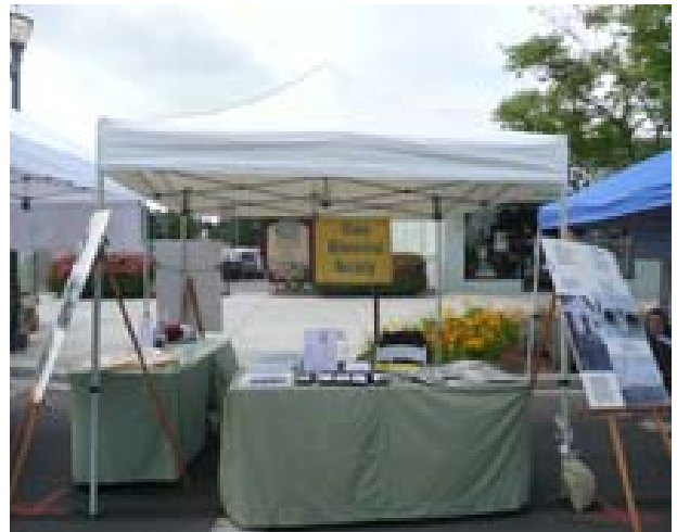
Historical Society Booth at the Chocolate Festival

Christmas Tea: December 14, 2008, located in the Park Terrace Café at the Gloria McClellan Senior