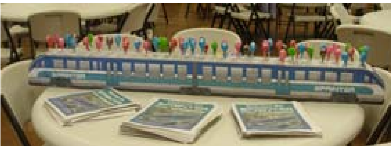
SPRINTER MODEL WITH CANDY