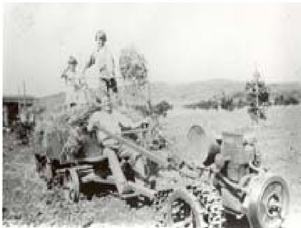
Helping on the farm about 1931.