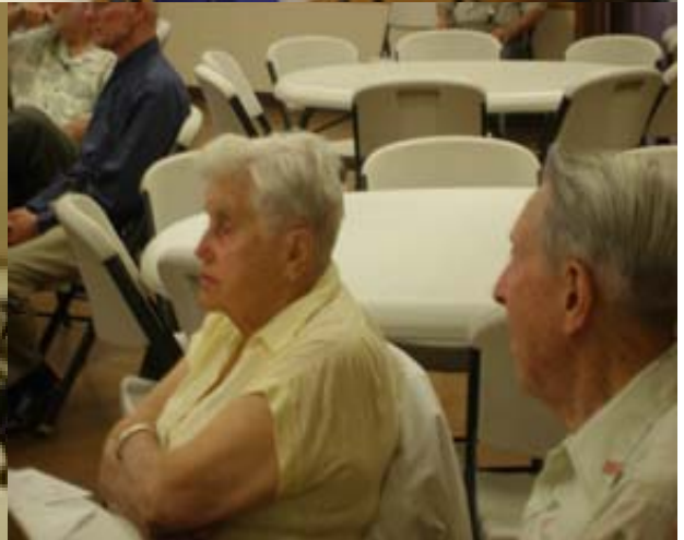
ABOVE, OUR GENERAL MEETING BELOW, VOLUNTEER LUNCHEON AT HENNESSEYS