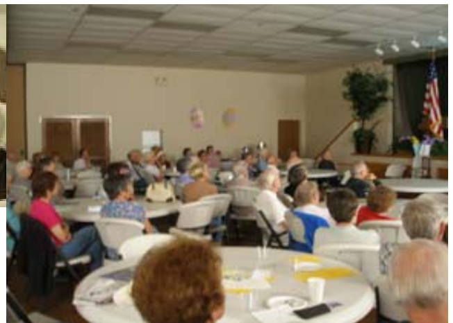
ABOVE AND FAR LEFT, PRESENTATIONS AT THE MEETING